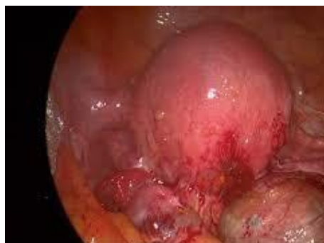
Deep infiltrating endometriosis (DIE)